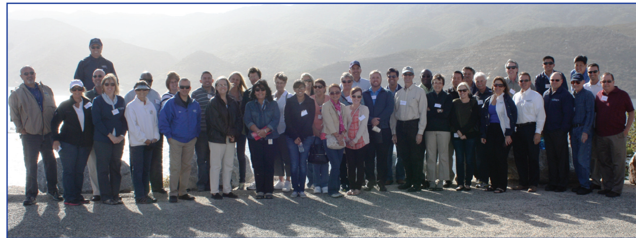
Local legislators, community leaders, and residents join CVWD on the Cucamonga Water Tour.