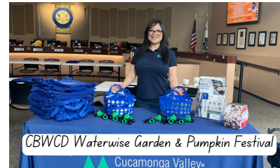
CBWCD Waterwise Garden & Pumpkin Festival Cucamonga Valley