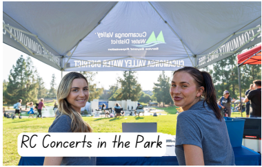
RC Concerts in the Park