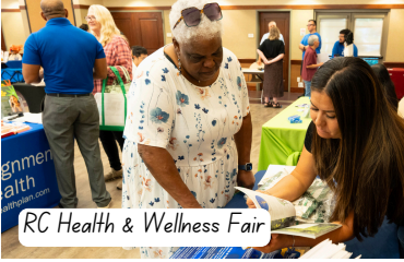
RC Health & Wellness Fair