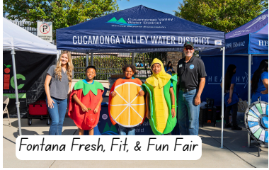
Fontana Fresh, Fit, & Fun Fair