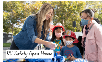
RC Safety Open House