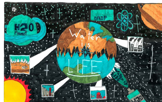
Nadriel Bolayog's Artwork - CVWD's 2024 Poster Contest Sweepstakes Winner