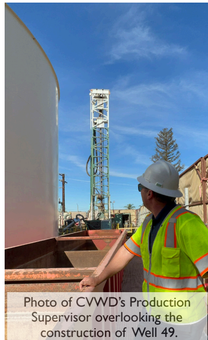
Photo of CVWD's Production Supervisor overlooking the construction of Well 49.