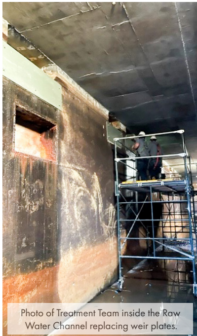
Photo of Treatment Team inside the Raw Water Channel replacing weir plates.