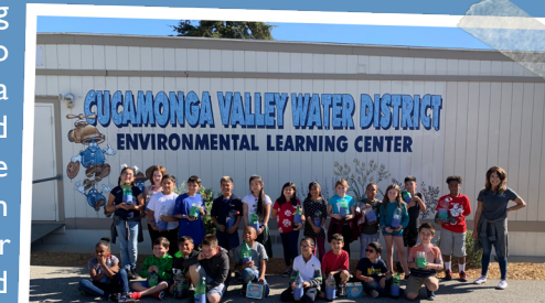
Learn more about our field trips by visiting CVWDwater.com/education .

CVWD takes pride in educating future generations by providing field trips to our Environmental Learning Center (ELC) for local students. We are proud to report that during the 2019-2020 school year, CVWD educated over 800 1st-12th grade students on a variety of topics including the water cycle, energy conservation, water technology, careers in water, and more. Thank you to our education partners, including the City of Rancho Cucamonga and the Inland Empire Resource Conservation District, for helping make field trips to our ELC possible!