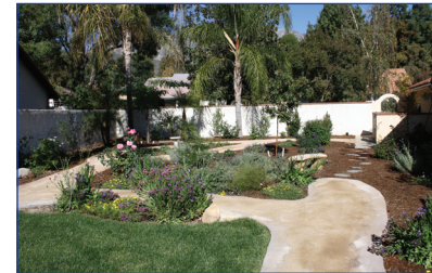
Charles & Trish Myers